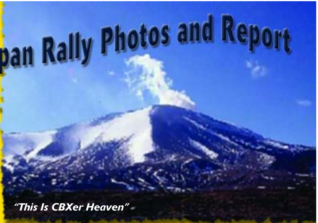
"This Is CBXer Heaven"

In the parking lot there and looking up at Mt. Asama, Motorbike Magazine took photos for their CBX article which I