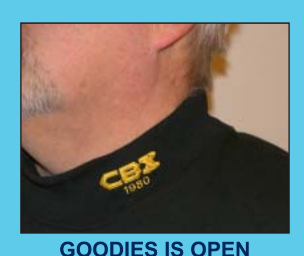
http://www.cbxclub.com/ Sale Item: ICOA T's $16.00 Coming Soooooon....Mock turtlenecks that match CBX colors and have model