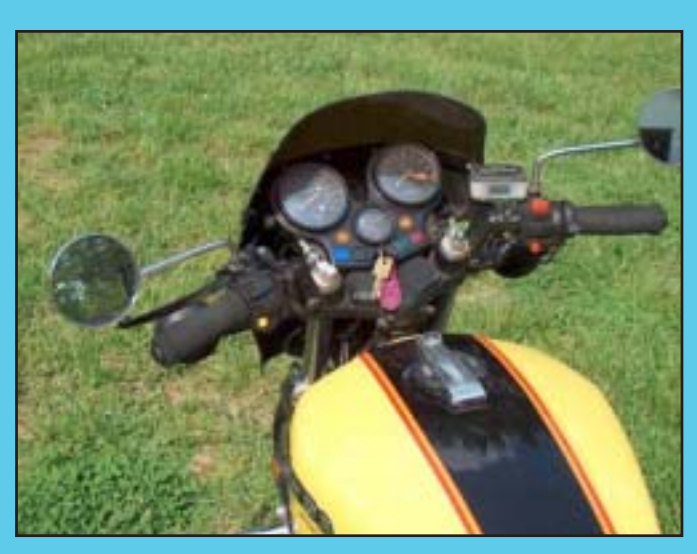
AL BLEYENBERG'S EARLY MODEL Handling, Looks and Cost Effective