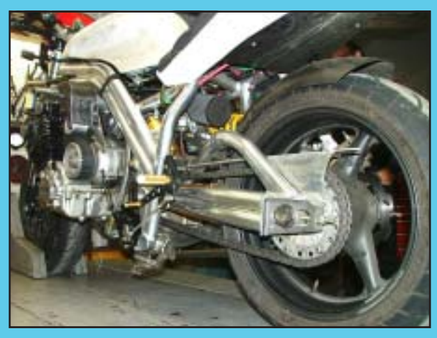
VERY SPECIAL CBXs TEAM Johnny Dupont's Supercharged Spondon CBX