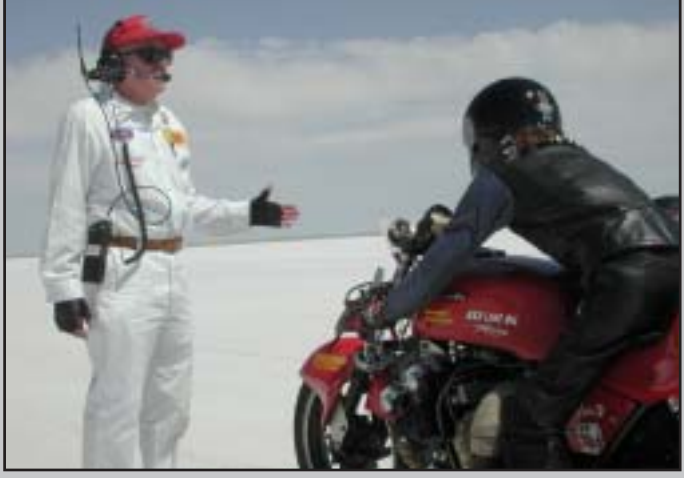
Start of 186.89 MPH Record Setting Run

DEDICATED TO THE PRESERVATION OF THE CBX MOTORCYCLE™