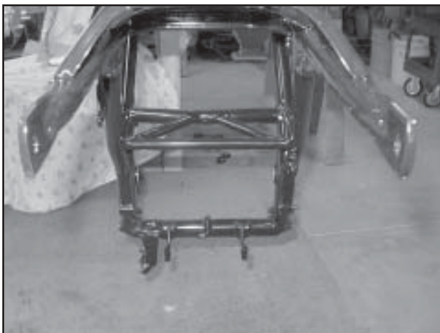
Rear from back